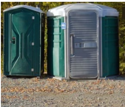
Set on Gravel