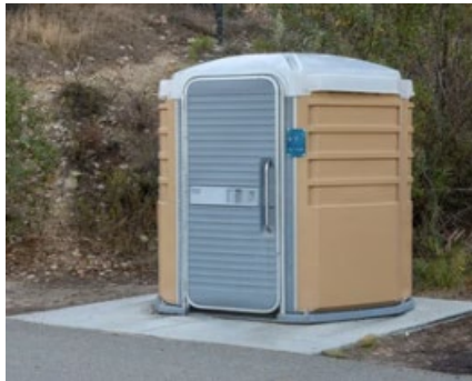
Set on Pad