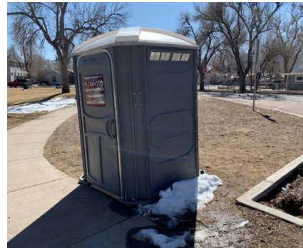
Set Abutting Sidewalk