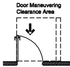
FRONT APPROACH - PULL SIDE