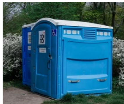
Set on Dirt Path