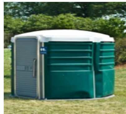
Set on Grass

*Please contact the Colorado Springs Office of Accessibility for more information or questions or comments regarding this guidance. ada.compliance@coloradosprings.gov or 719-385-5175