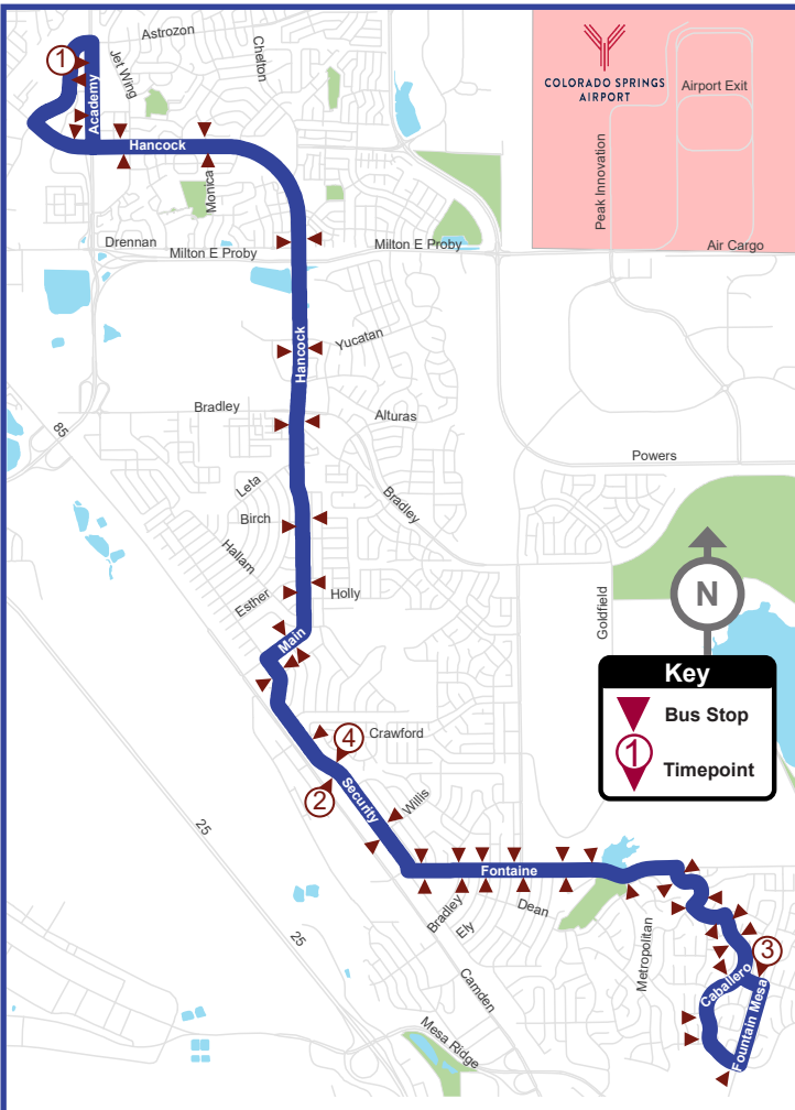
Numbers on map correspond to numbers on schedules.