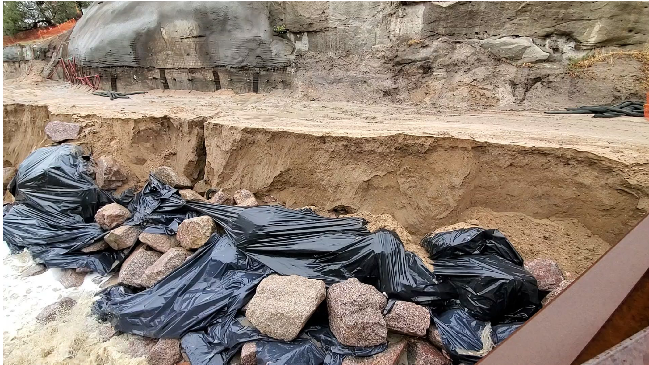
Cottonwood Creek APTS