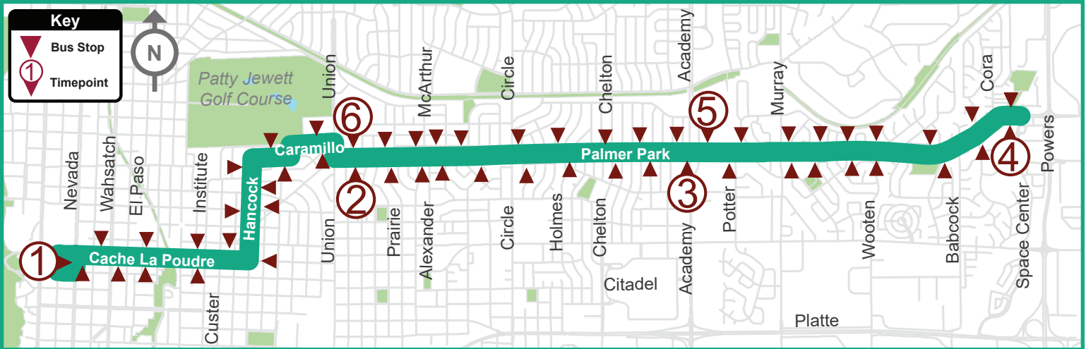
Numbers on map correspond to numbers on schedules.